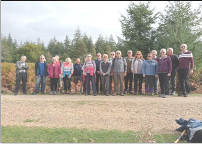
Ramblers Group – Cadmans Pool Wednesday 12 th October 2022