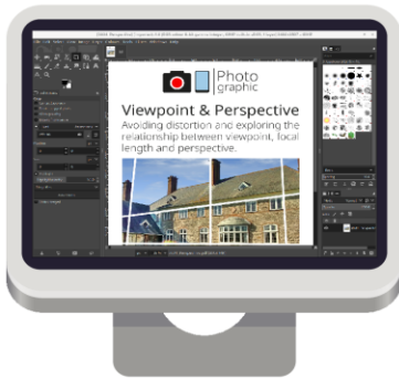
Icons - Gnome Project