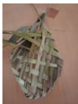
An example of leaf manipulation

We have continued to enjoy our flower arranging, creating ideas for a 'tea party' and 'special celebration'. At our recent meeting we learned how to manipulate large leaves into different designs. For future meetings, we will be interpreting a 'country walk' and 'summer holidays', then our last meeting of the term we will enjoy an afternoon tea at the Castle. Hopefully, we will all return in September full of exciting new ideas.